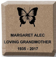
8x8 Custom Brick w. Graphic