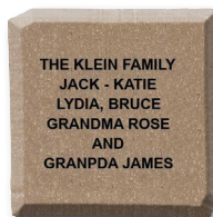
8x8 Custom Brick w. out Graphic