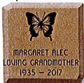
8x8 Custom Brick w. Graphic